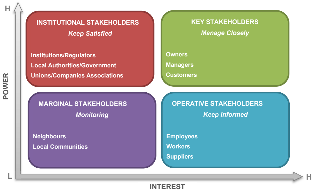
Fig. 6 – PASELL Stakeholders: Power/Interest Picture

The gained understanding is summarized in the following picture to easily see which stakeholders are expected to be blockers or critics and which stakeholders are likely to be advocates and supporters of our organization.